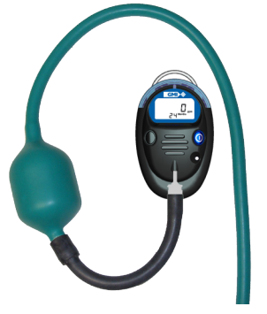
Fig. 2-12 Remote Sampling Set-up

Remote sensing is carried out with the hand aspirator for non-reactive gases, using the sample connector and the sample tubing supplied, as shown in Fig. 2-12.